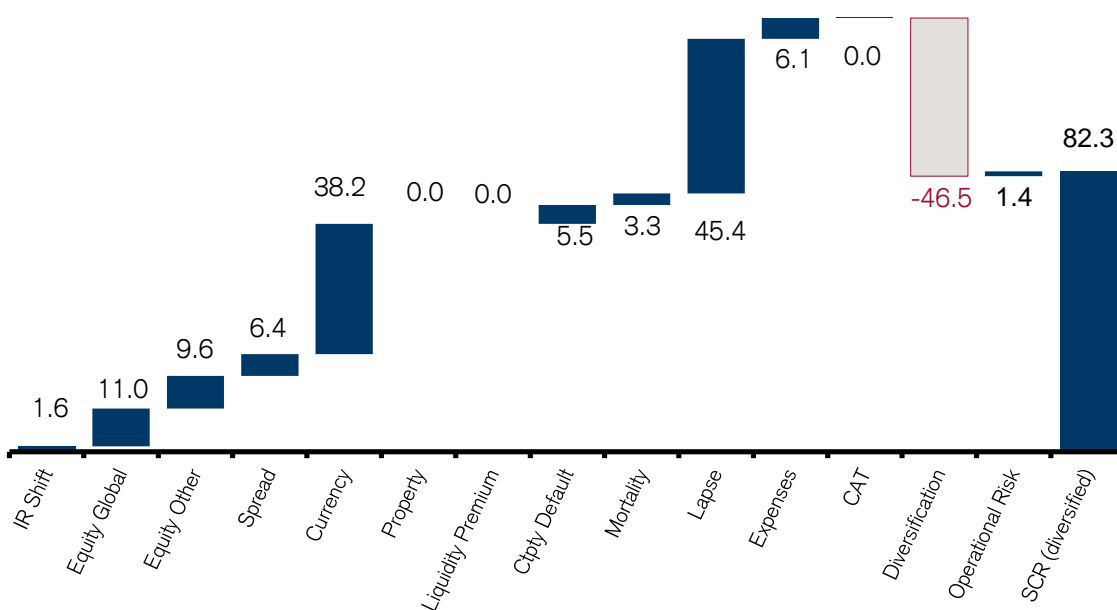
Figure 6b: CSLP's Decomposition of SCR as per 4Q17