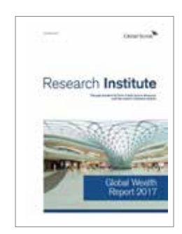
Global Wealth Report 2017