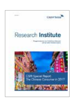
CSRI Special Report: The Chinese Consumer in 2017