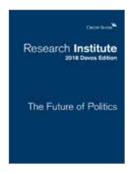
The Future of Politics – Dayos edition